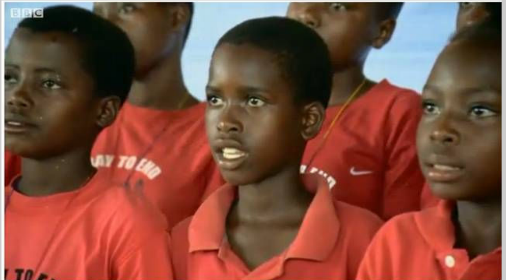
Children wearing t-shirts emblazoned with the message 'Pray to end child sacrifice' are filmed as part of the BBC News report on Jubilee Campaign's findings in Uganda.